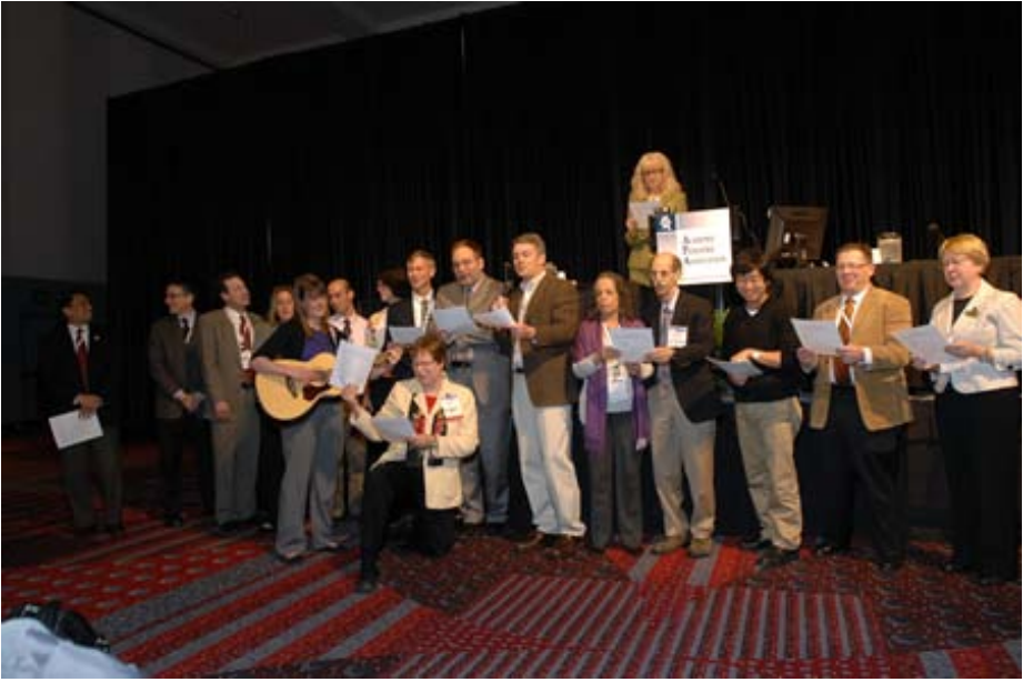
APA Board singing

APA Membership Meeting and Debate Photo Slideshow